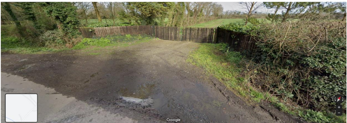
North Field Entrance