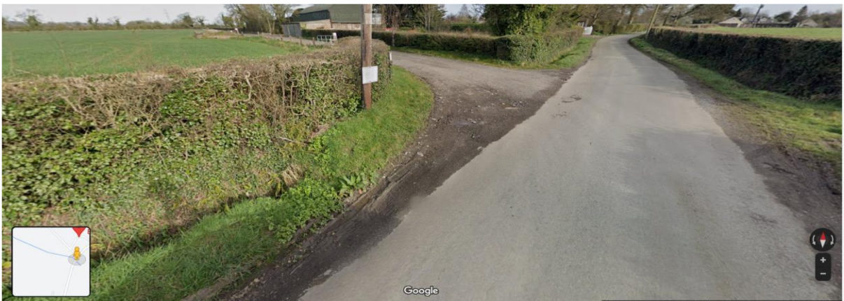
South Field Entrance